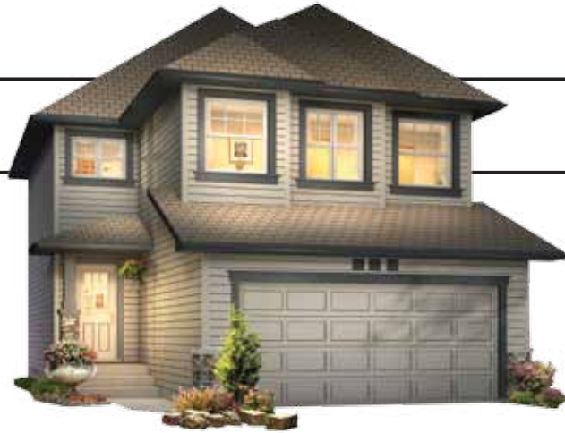
Job # SCH-0-031304 , Lot 4, Block 3