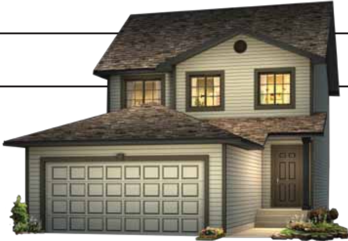
Job: SCH-0-032238 - Lot 50, Block 2, Plan 112 0832