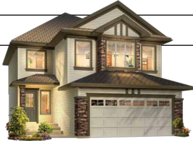
Job # WND-0-032050 Lot 4, Block 8, Plan 092-6441