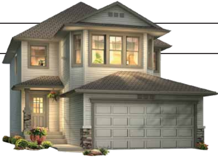
Job # SUN 1424- Lot 66, Block 5, Plan 062-5854