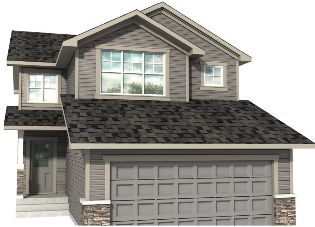
Job # LDV-031243 Lot 23, Block 5, Plan 072-5987