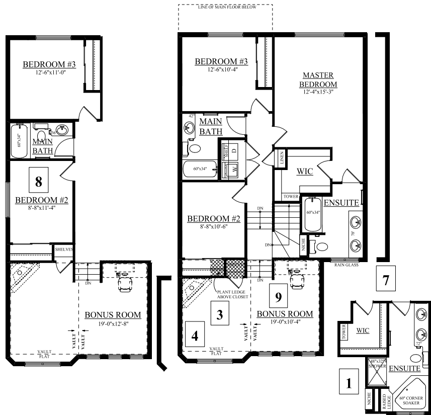
SECOND FLOOR 1028 SQFT