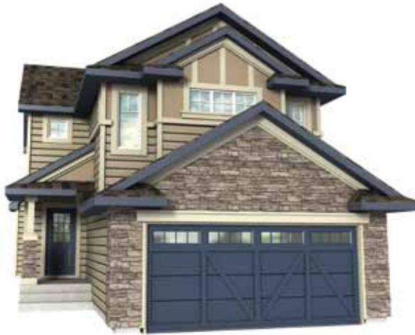
Job # AMB-0-032043, Lot 66, Block 7, Plan 072 9436