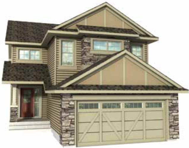
Job # AMB-0-032045, Lot 68, Block 7, Plan 072 9436