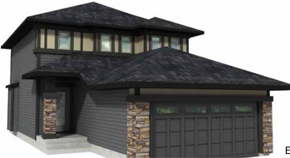
Elevation E, Prairie