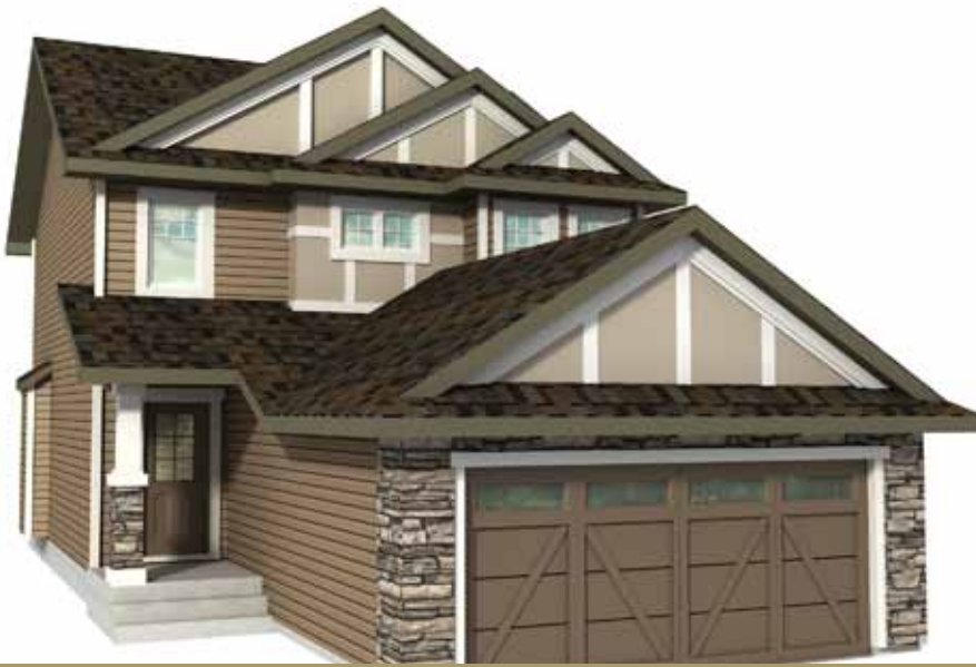
Elevation D, National Heritage