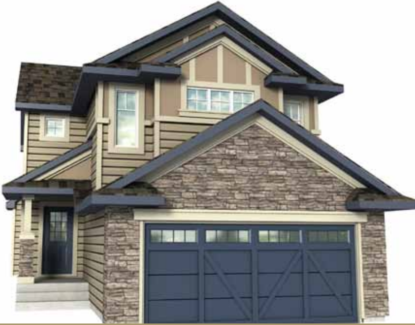
Elevation D, National Heritage