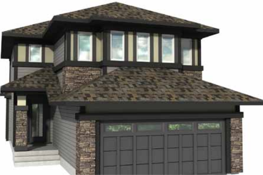
Elevation E, Prairie